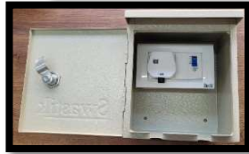
ELECTRIC VEHICLE CHARGING BOX